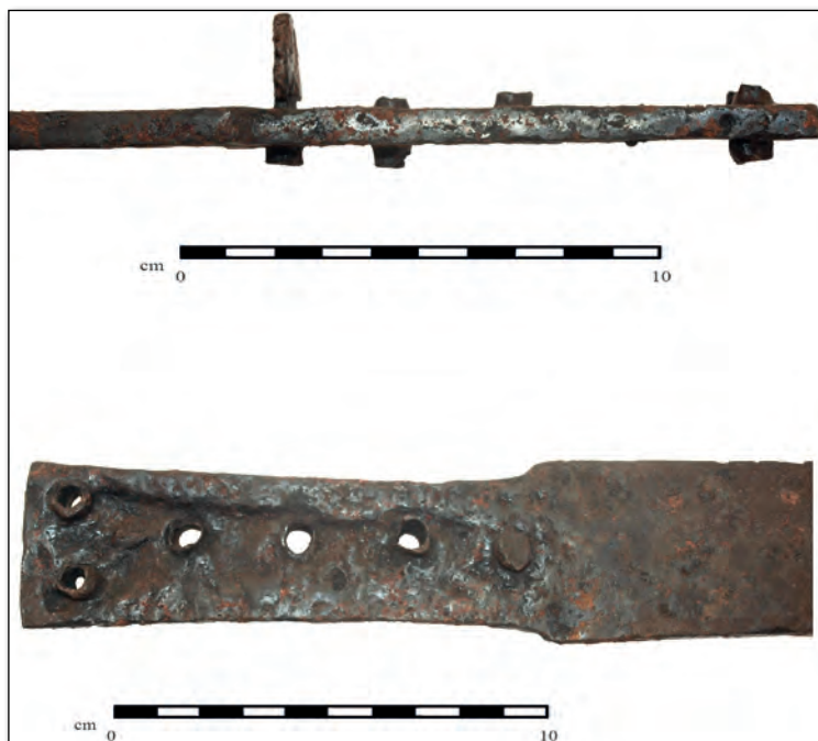
Fig. 3. Tessak, Inv. numb. 790. Vatevi weapon collection, located in Plovdiv, Bulgaria. View of the tang.