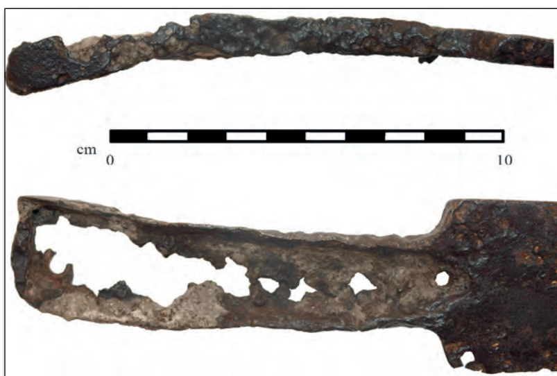
Fig. 5. Tessak, Inv. numb. 791. Vatevi weapon collection, located in Plovdiv, Bulgaria. View of the tang.