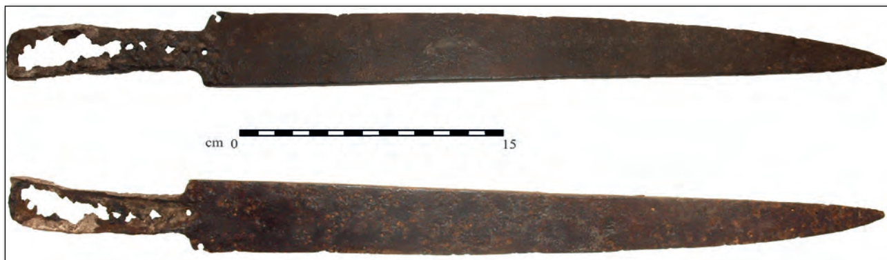
Fig. 4. Tessak, Inv. numb. 791. Vatevi weapon collection, located in Plovdiv, Bulgaria. General view.