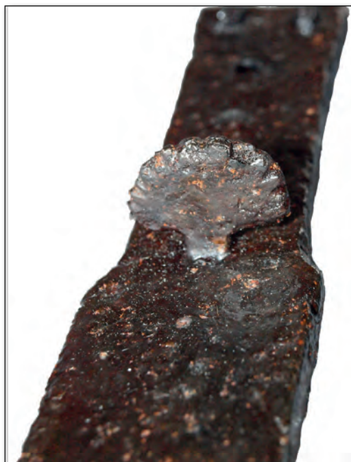
Fig. 2. Tessak, Inv. numb. 790. Vatevi weapon collection, located in Plovdiv, Bulgaria. View of the protecting nail.